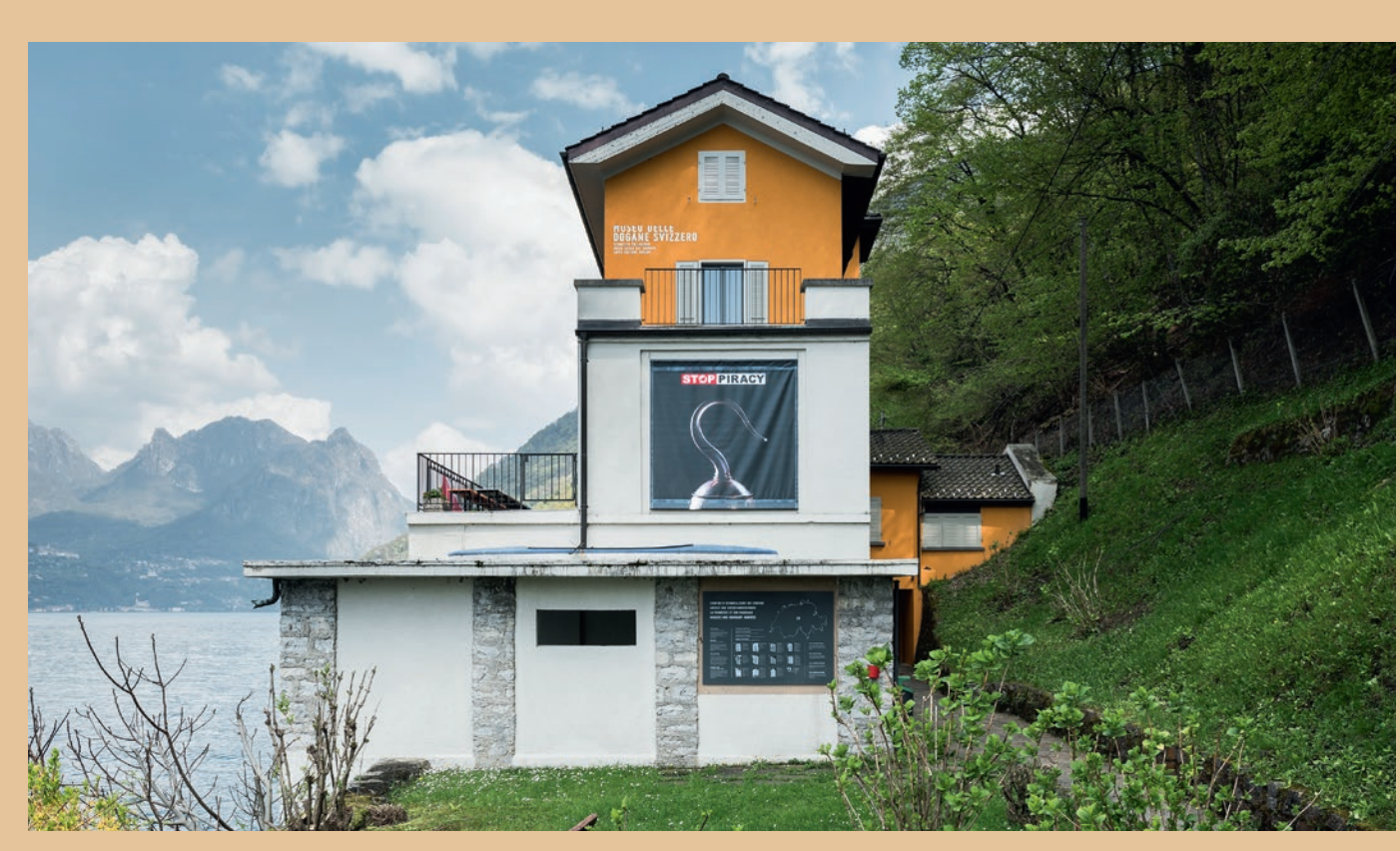
Images from the special exhibition "Beguiling Appearance – Murky Shadows?" on counterfeiting and piracy in the Swiss Customs Museum in Cantine di Gandria, Lugano.

Although smuggler-hunting border guards did indeed use to live in the Swiss Customs Museum, it's firmly in the hands of counterfeiters until 20 October 2018 – just look out for the pirate's hook!